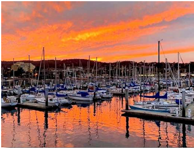
16-Sunset at the Pier