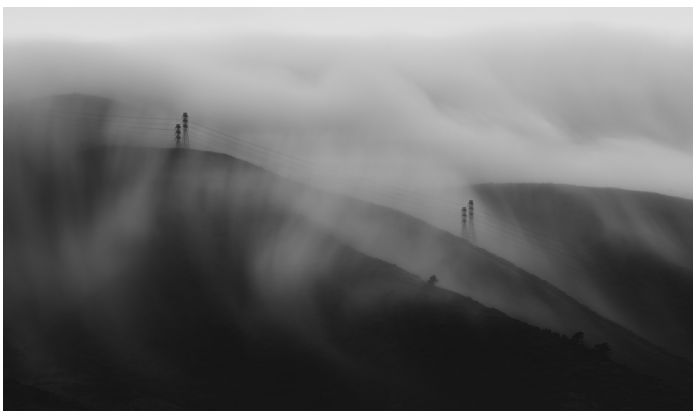
03 - Clouds Flowing Over Mt. Bruno

COMMENT: Well shot alpine lake scene. Not much I can offer here. That reflection and that little splash of red are tasty elements. I can't help but wonder what another composition up or down the shoreline would yield.