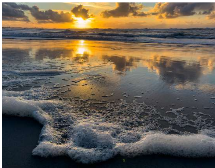
15 - Sunset at Asiloma

COMMENT: Interesting photo. I could look at this for awhile. Looks like some issues from editing maybe. In the group of birds in the top left there appears to be some kind of artifact. Spaceship maybe? Some lack of gradient/details in the hills from a filter maybe? Otherwise it appears to have been shot well.