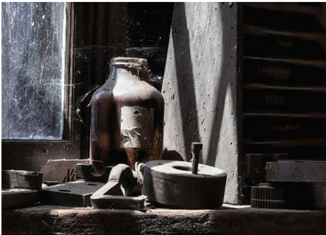
08 - Long Forgotten

COMMENT: Quite a prickly piece. It's well done, technically. I'm wondering what compelled you to shoot exactly that particular group.