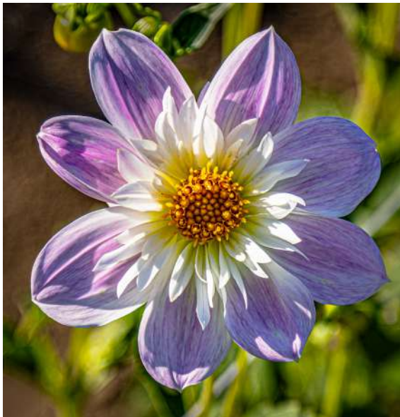
09 - Macro Beauty

COMMENT: I appreciate the textures and the light here. This has quite a nostalgic feel. Like I'm in grandpa's tool shed. I wonder if shooting from a different angle would be fruitful?