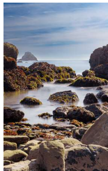
Third Place - Weston Beach, Point Lobos Sara A Courtneidge