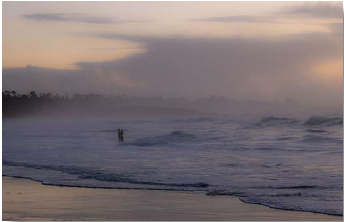
11-In The Mist

COMMENT: I like this as a piece of art. As a photograph I would have liked to see some part of it in sharp focus. There are some great details that might have really shined like the water drops, the colors on the bird, and the flower.