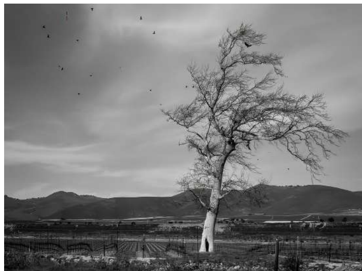
14 - Still Standing

COMMENT: There is some really interesting light going on here. The light the person in the back is holding adds a lot. I would like to see this shot with the light but without the second person. Otherwise, I like the light/shadow play.