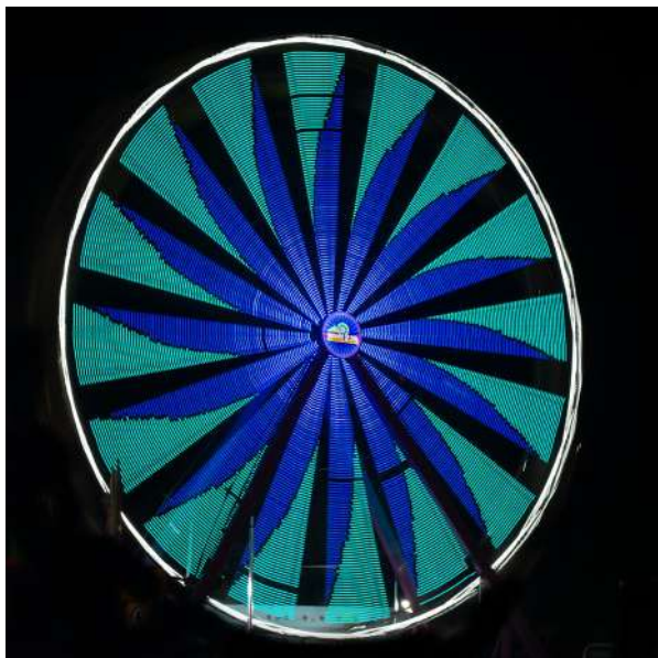
09-Ferris Wheel 1.6 Exposure

COMMENT: The more I look at this the more I like it. It's simple yet has a lot going on. The juxtaposition of static and motion, the contrasting colors, the depth of field. The execution and handling of the image are well done