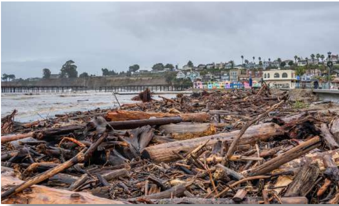
04 - Debris on the Beach After Storm in Capitola