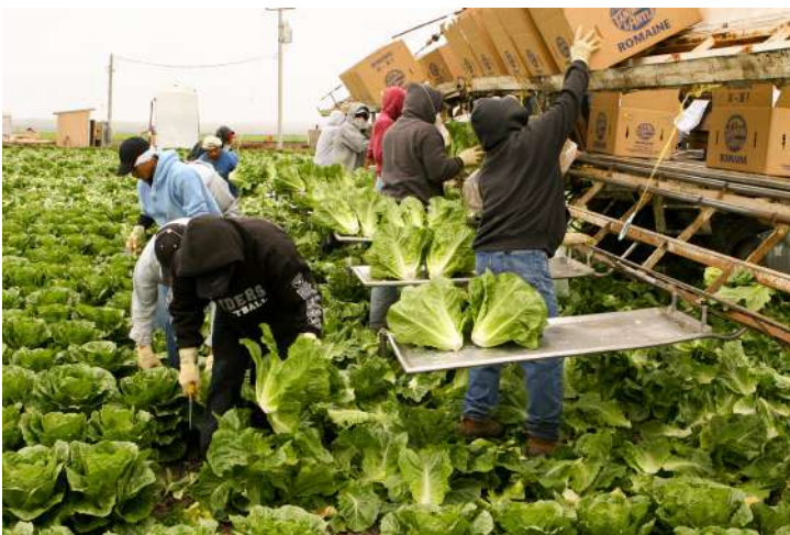
06 - Farm Workers

COMMENT: What a capture! The tack sharp focus of the cat and the bee is just great. The light. The cat's tongue. The whiskers. I don't know what else to say.