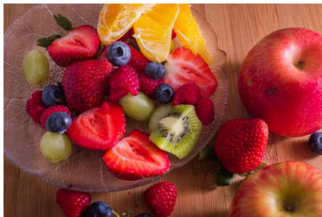
Cut Up Fruit Brian Spiegel