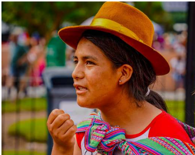
18-Young Lady from Peru

COMMENT:What a moment you've captured! The horse's well lit face says it all. The tack sharp focus, the airborne dirt, the levitating ropes, and all the other details make me smile. From the darkest shadows to the white on the horse's head you've tastefully handled this image. I especially enjoy the rider/horse light/shadow combination. It really makes the horse the star.