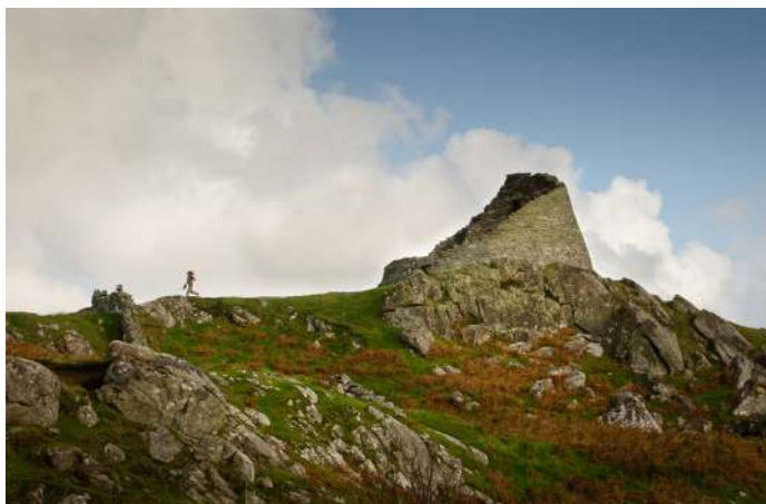
15-Running from the Broch

COMMENT: I like the bold, simple composition here. Well done.