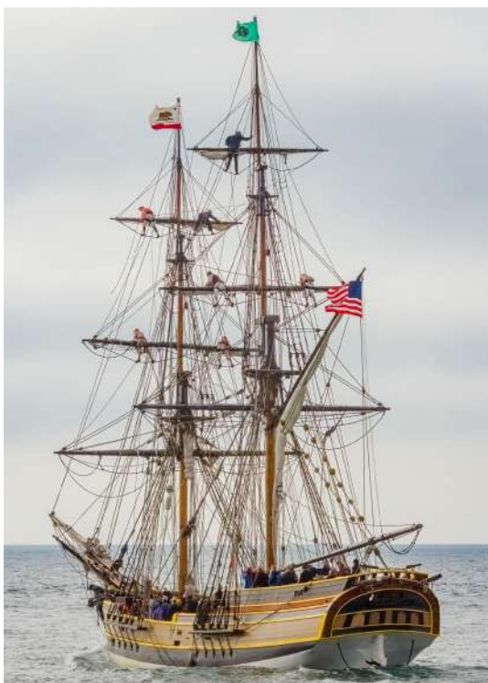
Putting to Sea Rick Verbanec