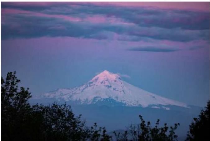
12-Mt. Hood at Dusk

COMMENT: This makes me want to take a vacation. This timeless scene could be anywhere. The indistinct background and the top to bottom misty gradient add to the feeling of not needing to know when or where it is. Technical considerations don't matter where we're going.