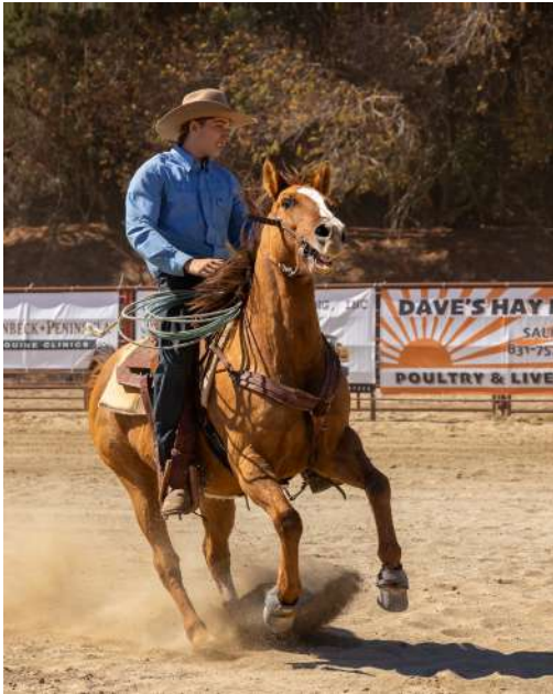
17-Workin the Corral

COMMENT:Colorful skies reflected in a watery foreground! That would get my attention any day of the week. The soft focus and visible pixels in the sky lead me to think maybe a camera with a really small sensor was used. Or maybe a bigger file with more data would help it?