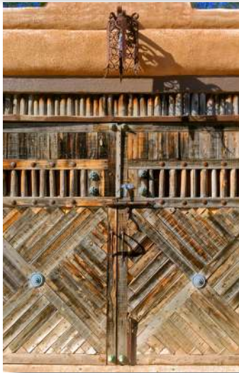
08-Fancy Garage Door - Los Cerillos NM

COMMENT:Great capture of a fun moment! No doubt what the story is, I just wonder if he struck out the batter. Well done throughout. Super sharp. Great light on the pitcher's face. I like the stripes of dirt and grass. I would be thrilled to have a photo like this of my son.