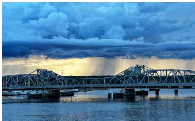
The Old Steel Bridge Bill Shewchuk