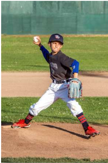
07-Determined 10 Year Old