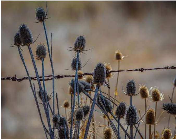
07 - Fuller's Teasel and Barbed Wire