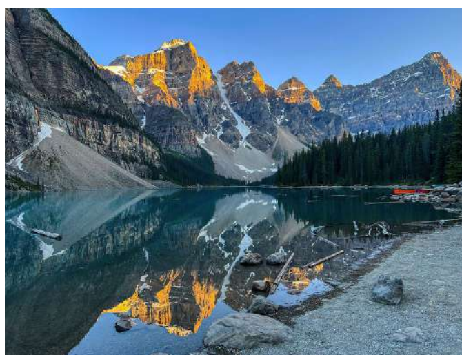
Canadian Mountain Sunrise