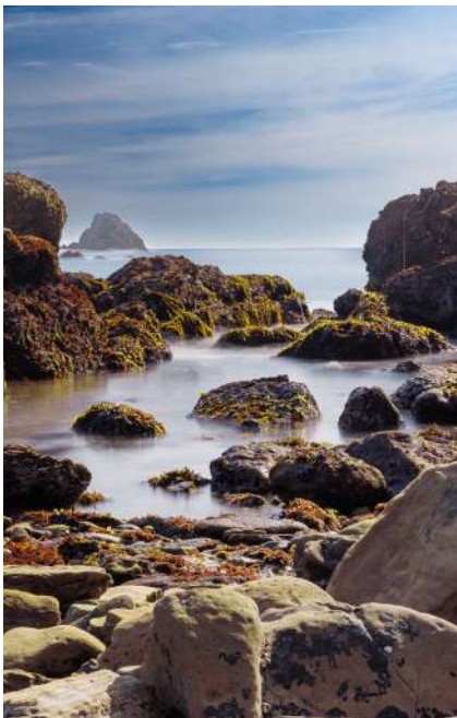
18 - Weston Beach, Point Lobos

COMMENT: I would like to be there enjoying this moment. I do appreciate the silhouette Trees. Also the sunbeams from the clouds. Maybe dropping the whole frame a tad would improve it. A touch more foreground.