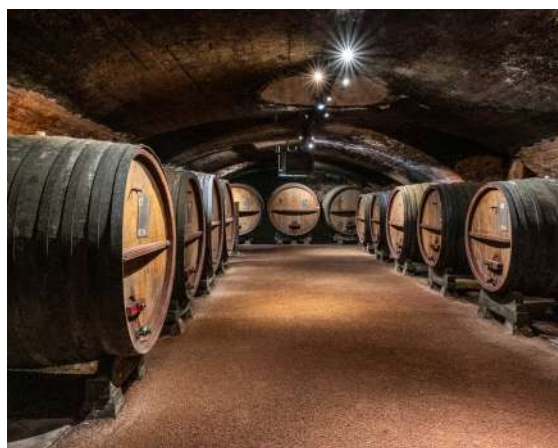
Third Place - Beaujolais Wine Cave Dick Light