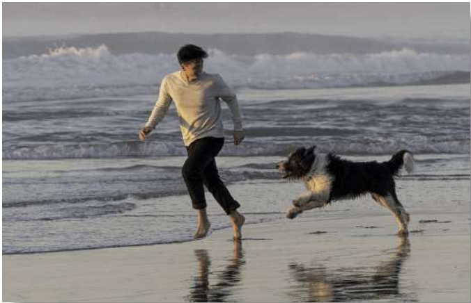
01 - Best Friends