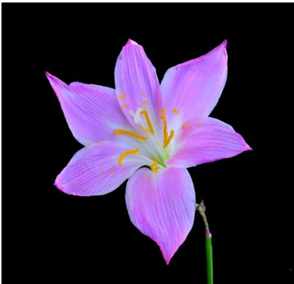
14-Pink Rain Lily

COMMENT: Technically speaking, I can't offer much here. I do wonder what exploring different angles might yield.