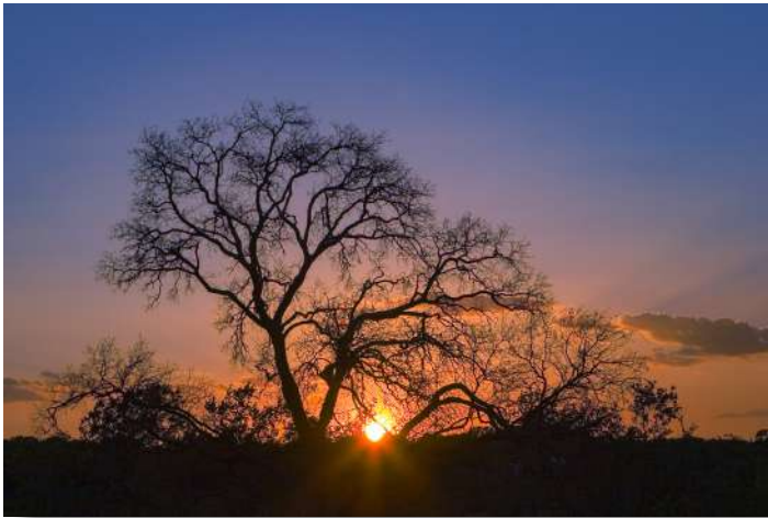
17 - WSunset in Texas

COMMENT: What a stellar shot this is! It has it all. So much to look at. The foreground vegetation is a nice jumping off point on your way up the coast to the horizon. The color throughout is tastefully handled. I really like the long exposure. Technically, I don't know what I would do differently. Very well done!