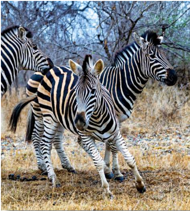
19-Zebras in Sabi Sands near Kruger South Africa