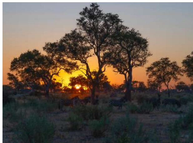
Third Place - Colors of the Botswana Sunset Karen Schofield