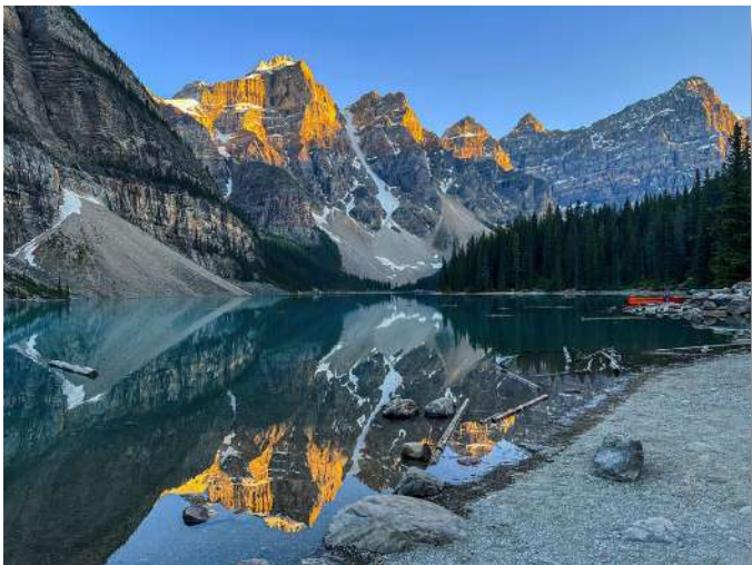
02 - Canadian Mountain Sunrise

COMMENT: What a joyful moment! Nicely shot exposure. The focus is on point. That soft warm light is great. I would be keen to see more reflection below those two . Maybe a vertical crop?