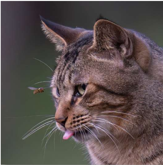
05 - Face-Off

COMMENT: Nice well shot documentation of Capitola. Maybe some afternoon light would add some spark to the scene.