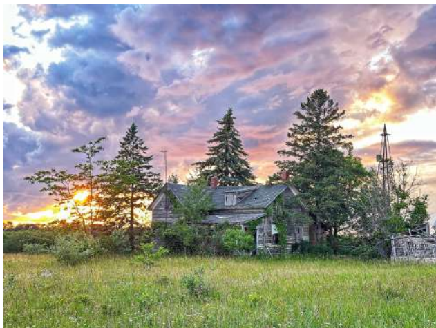
Abandoned Farmhouse