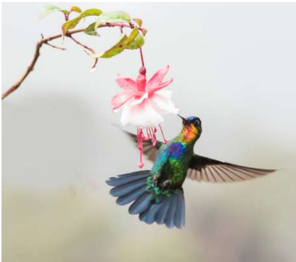
10-Hummingbird of Costa Rica