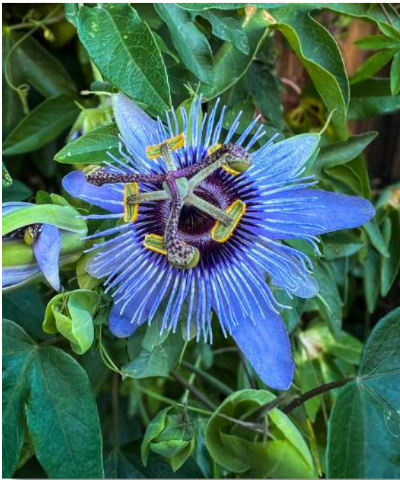
13-Passiflora 'Purple Haze'.