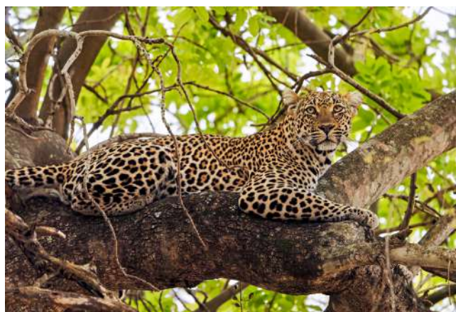
Second Place - Big Leopard in a Tree at Sabi Sands near Kruger South Africa Rick Thau