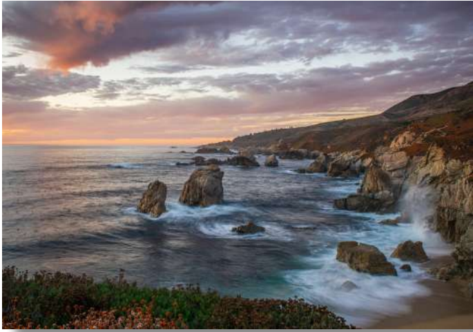
16 - Sunset at Soberanes